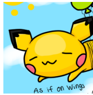
Evan Chen's Personal Sty File